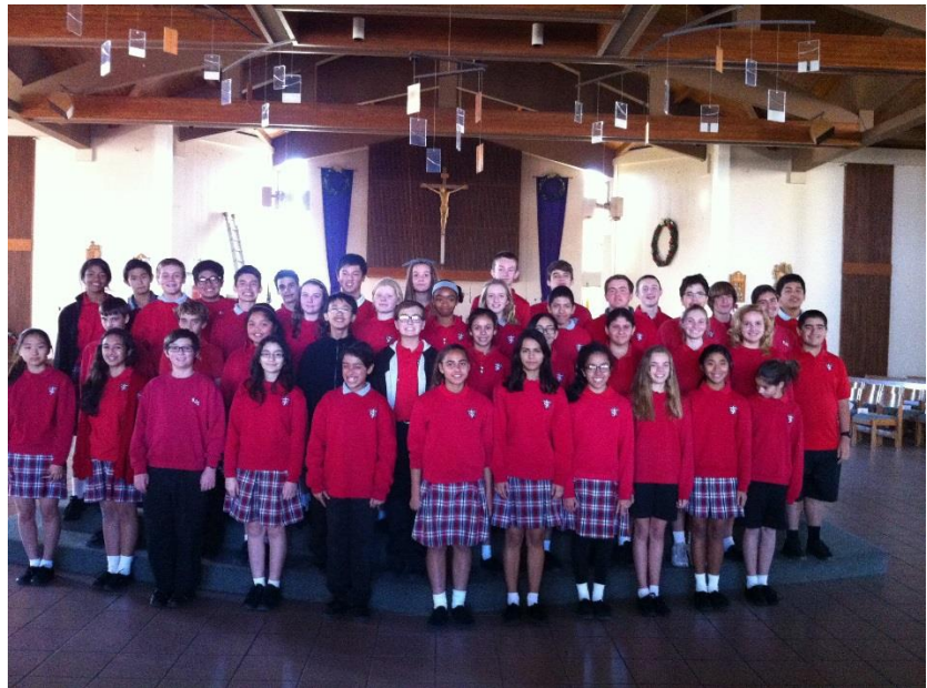
The 2013-2014 7th and 8th graders rehearsing in the church the afternoon before the night of the pageant.